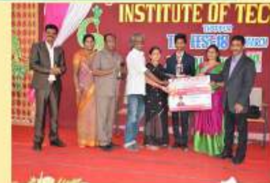
BEST OUTGOING STUDENT AWARD- 2018