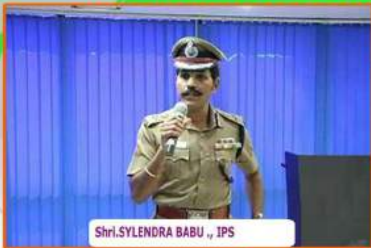
Shri. SYLENDRA BABU, IPS