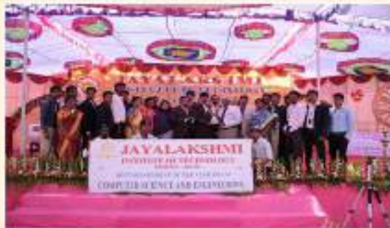
BEST DEPARTMENT OF THE YEAR 2014

Offer up to date and flexible programs which will allow our graduates to be competitive in the job market