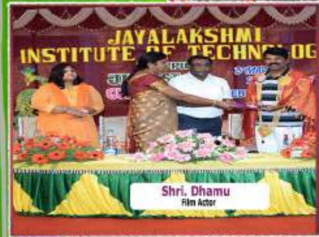
Shri. Dhamu Film Actor