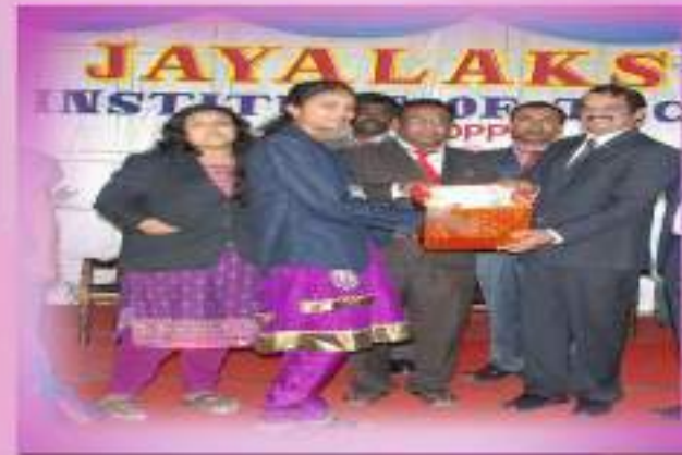
2013 Dr.Mylswamy Annadurai Project Director Chandrayaan-1&2 ISRO, Bengaluru