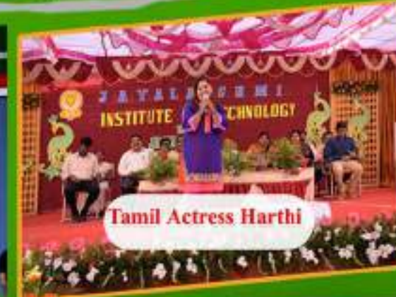
Tamil Actress Harthi