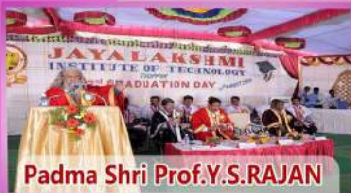
Padma Shri Prof. Y.S. RAJAN ISRO, Bengaluru