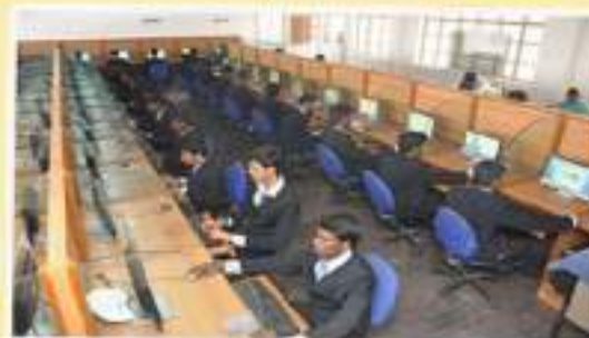
UPGRADING EMERGING TECHNOLOGIES